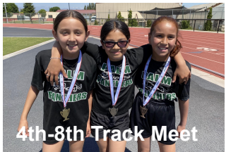
4th-8th Track Meet

Visit our Donor Wall https://cutlerorosi-cfy.org/donor-honor-roll/