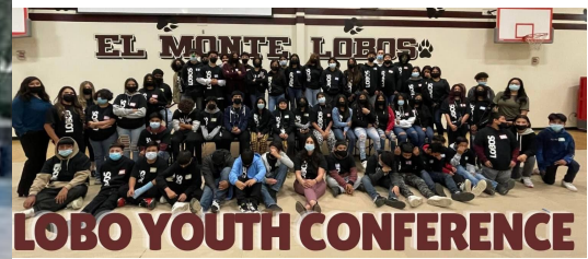
EL MONTE LOBOS LOBO YOUTH CONFERENCE