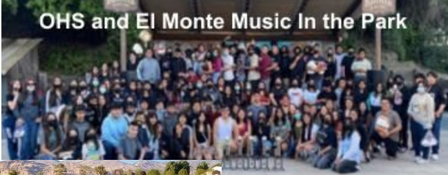
OHS and El Monte Music In the Park