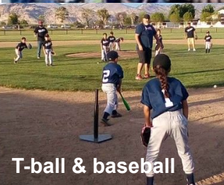
T-ball & baseball